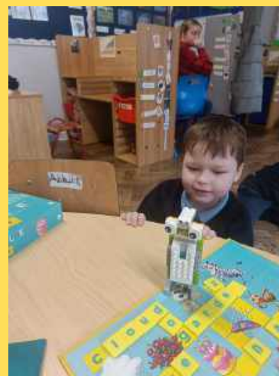
Lego WeDo 2.0