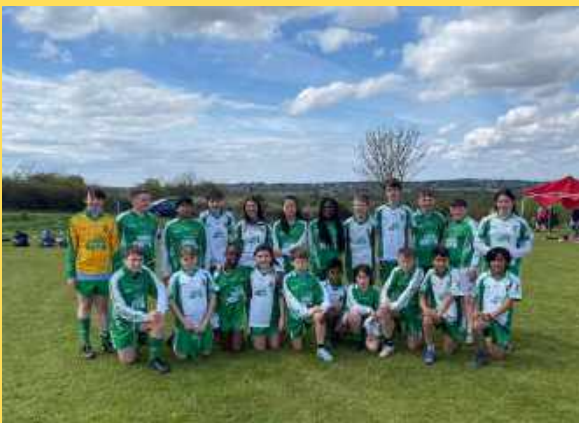
5th & 6th class at the Fr. Griffin's/Éire Óg blitz