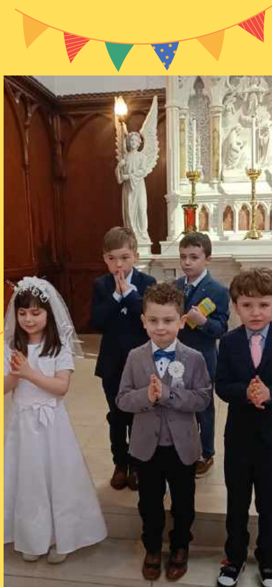
Holy Communion We had a fantastic day