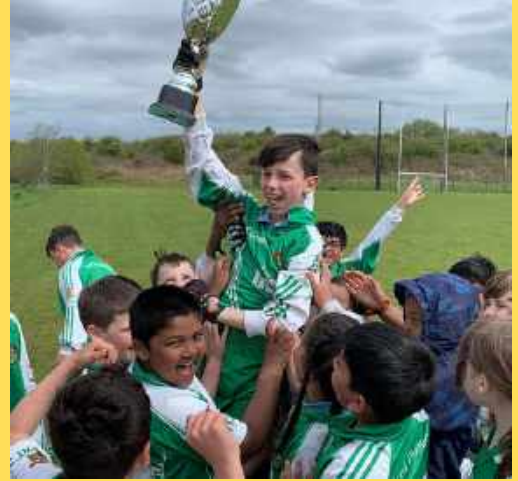
Winners of the Fr. Griffin's/Éire Óg 3rd/4th class blitz