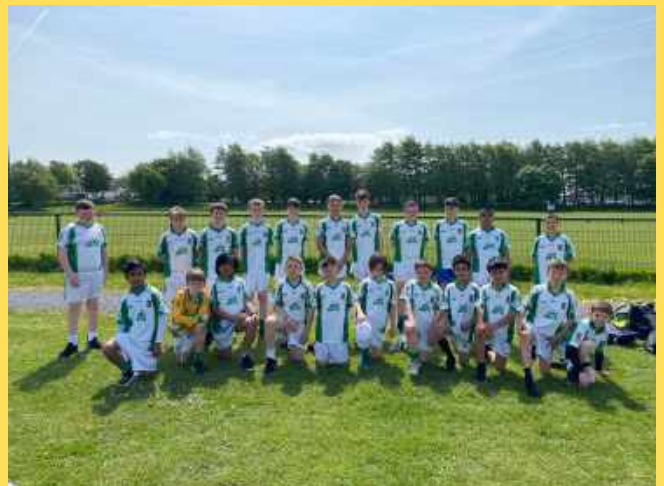
Boys' Gaelic Football Cumann na mBunscol Blitz at St. James' GAA