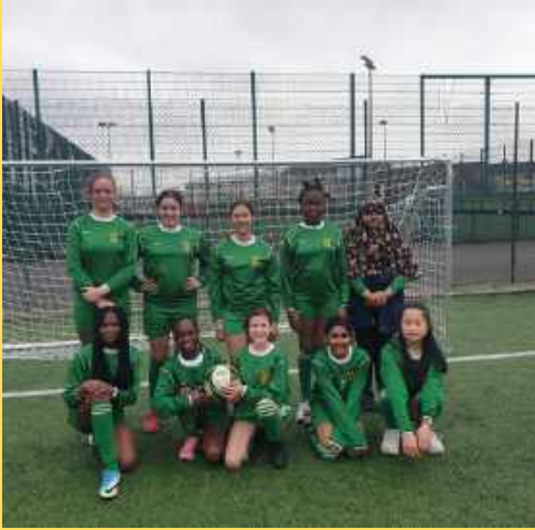
Girls soccer – winners of the qualifying stages. Played in the finals in Mervue. Our first ever all girls team to represent the school.