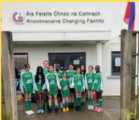
Girls' Gaelic Football Cumann na mBunscol Blitz at Cappagh Park